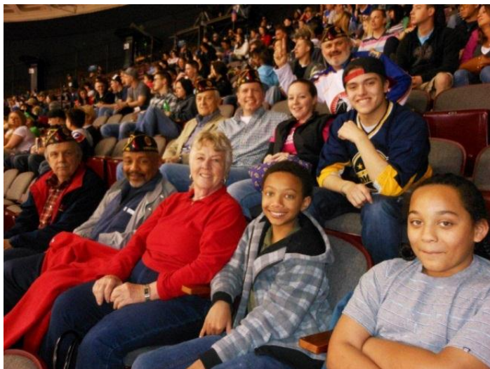
Post 110 members enjoying the hockey game.